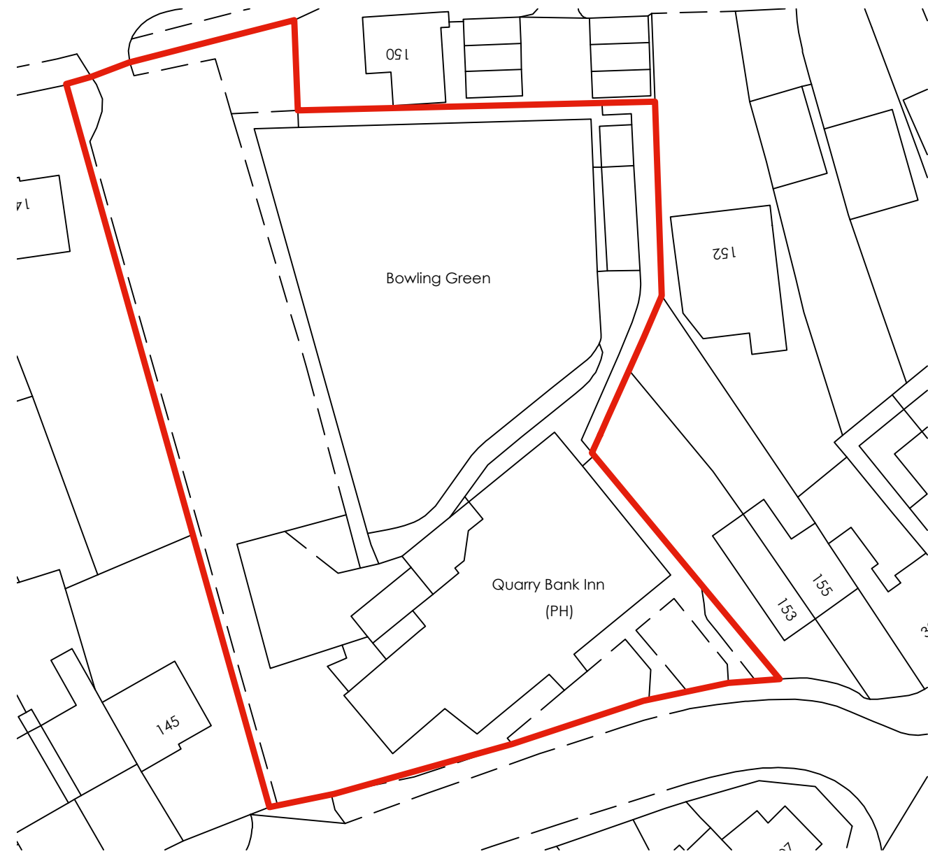
PROPOSED SITE PLAN (1:500)